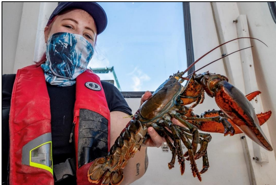
Figure 2: Lobster scientist from the Fishermen and Scientist Research Society showing a tagged lobster prior to release.

FORCE conducted a baseline lobster catchability survey in fall 2021 (Fishermen and Scientists Research Society (FSRS), 2023) following the study design developed by TriNav Fisheries Consultants Ltd. in 2019. This study design was implemented in partnership with the FSRS (Figure 2) and with the assistance of a local lobster fisher. The report from this work was provided in 2023, and the results indicated a 'high' catchability rate (i.e., CPUE \geq 2.4 kg/trap haul) during the fall survey. This is consistent with a prior baseline survey at the FORCE site in 2017 (NEXUS Coastal Resource Management Ltd. 2017), and is comparable to available commercial landings data provided by Fisheries and Oceans Canada (DFO). The study design will be repeated once an operational device has been deployed at FORCE to gather effects testing data and test the predictions of the EA.