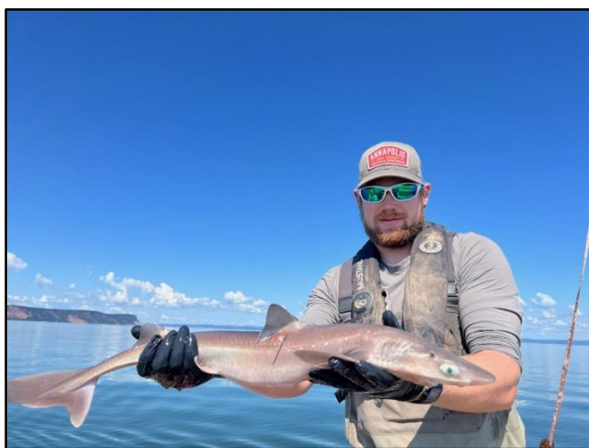
Figure 3: Acoustic tagging of spiny dogfish from the Minas Basin by RAP partner organization Mi'kmaw Conservation Group in 2022.

In 2021 and 2022, the FORCE array of acoustic receivers consisted of 12 stations set approximately 150 metres apart, and extended from the FORCE site out towards the middle of Minas Passage. However, this resulted in incomplete coverage of Minas Passage for detecting tagged fish. For 2023 and 2024, FORCE and OTN have collaborated to establish more complete coverage of the area by merging their respective lines of acoustic receivers into a 24-station array that spans the vast majority of Minas Passage (Figure 4), thereby increasing the probability of detecting tagged fish as they navigate through the area. This array was established in May 2023 and while the original intent was to recover the array in the fall, discussions between FORCE, Acadia and OTN extended the coverage until spring 2024 to increase the temporal scale of monitoring. Preliminary results suggest that merging the lines of acoustic receivers has improved the probability of detection of passing events for Inner Bay of Fundy Atlantic salmon post-smolts to p=0.979 (B. Sanderson, pers. comm 2024). Although this is encouraging, more work is needed to ensure the accuracy of this estimate.