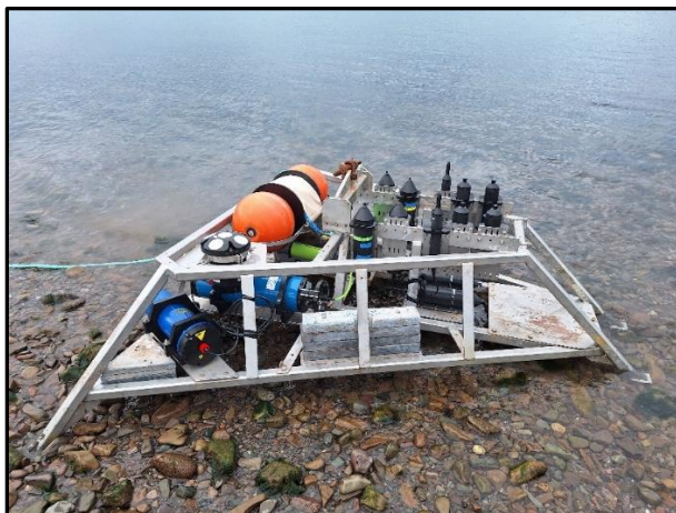
Figure 5: FAST-2 platform equipped with five Innovasea acoustic receiver technologies (with duplicates for redundancy), an ADCP and hydrophone for recording flow speed and underwater noise.

FORCE recently collaborated with Innovasea to test innovative new acoustic receiver technology in Minas Passage to assess instrument capabilities in high flow environments. Five different acoustic receiver technologies (with duplicates for redundancy) were mounted on the FAST-2 platform and deployed at the FORCE site in September 2023 (Figure 5). A Nortek Signature 500 Acoustic Doppler Current Profiler (ADCP) was deployed alongside the acoustic receivers to record flow speed, along with an OceanSonics icListen HF hydrophone to record underwater noise that can impact the detection of acoustic signals. A series of passive drifts were then conducted over the platform using acoustic tags of various frequencies deployed at differing depths. The drifts were conducted on the flood tide during the strong spring tides of late September and early October 2023. The platform was recovered in mid-October and the acoustic detection data downloaded from the receivers for analyses. Although preliminary, results of this work are encouraging, and suggest that a prototype acoustic receiver technology that is currently under development can detect acoustic tags at flow speeds up to 5 m/s; a considerable improvement over current 'off-the-shelf' acoustic receivers. FORCE continues to work with Innovasea to develop additional study designs to further assess the capabilities of this prototype technology.